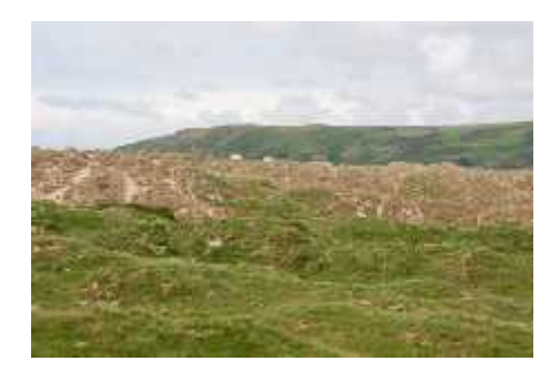
Fixed dune Ynys Las