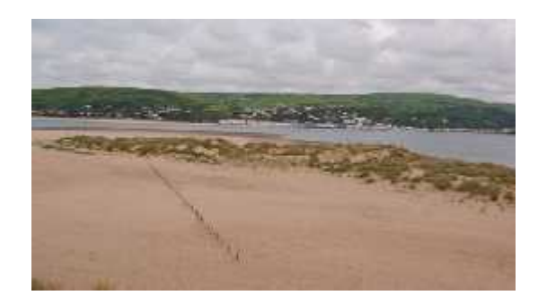
Embryonic dune Ynys Las