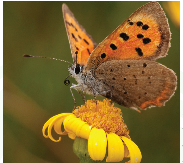
Small Copper Butterfly