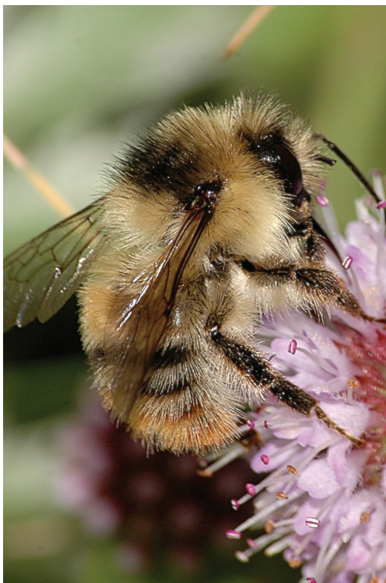
Shrill Carder Bee ( Bombus sylvarum)