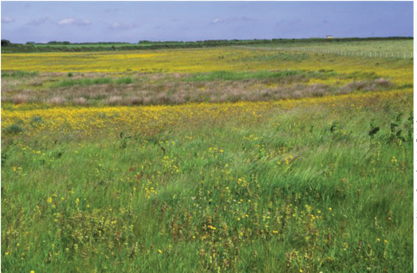
Is spraying necessary? Newton Farm - Pembroke

Contact your local Beekeepers Association and talk to them about keeping bees yourself or hosting an apiary looked after by a local beekeeper, and get some honey in return.